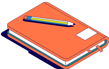
Answers: 4, 8, 8

It’s okay if you missed one or two—there were a lot of numbers in there. Thankfully, when we talk about doing right so others can see God, that’s not the same kind of “right” as getting the correct answer on a math quiz. When we choose to be truthful in everything we say and do, that’s the kind of “right” that shows others who God is.